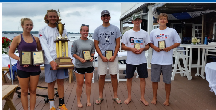
2017 Junior Championship Regatta Winners